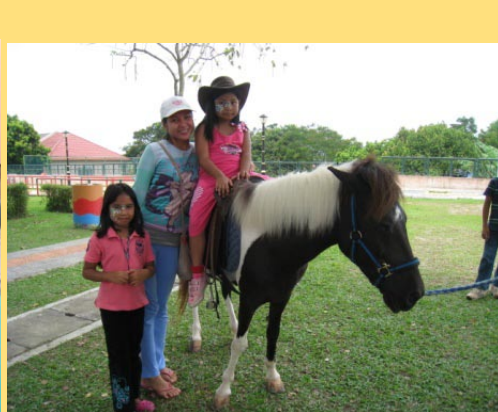
🎵 Lucy the Pony