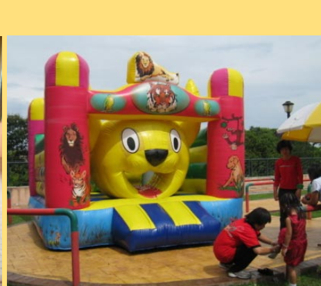
🎵 Inflatable play area