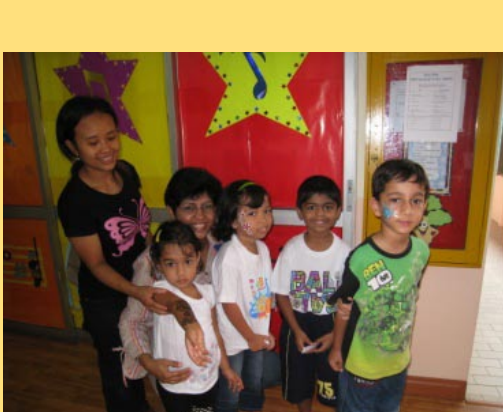
🎵 Happy kids with painted faces & hand