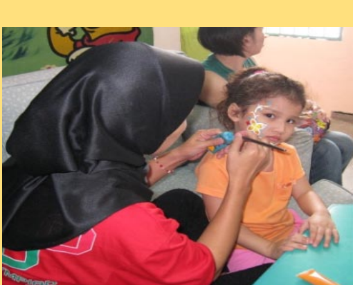
🎵 Face Painting

“The carnival is FANTASTIC! We had a G-O-O-D time! My teachers and I will take this event as a learning process so that we can organize a R.E.A.L GREATER carnival the next round!”