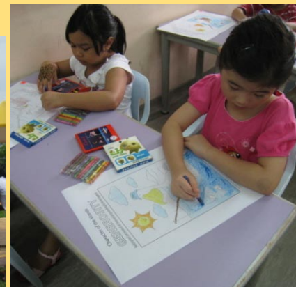
🎵 Coloring Contest & the winner