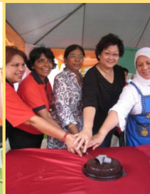
🎵 R.E.A.L Kids TTDI Centre